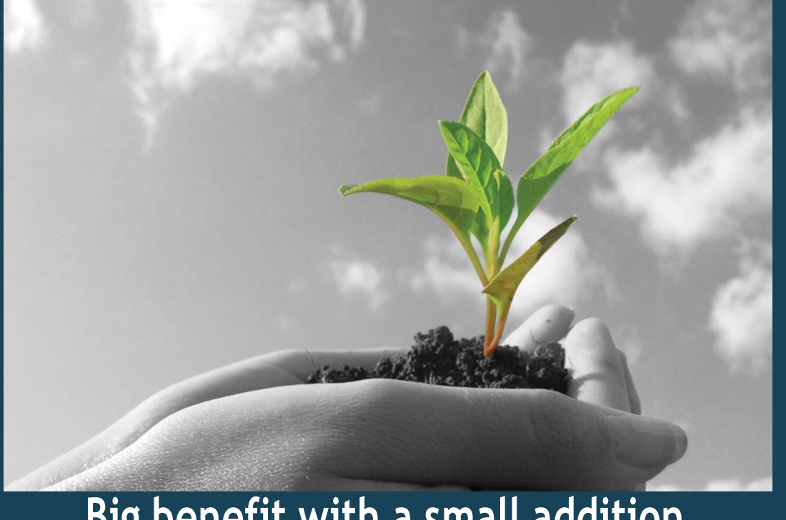
Big benefit with a small addition